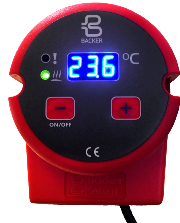
Box max temp 55°C