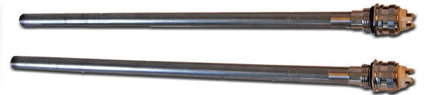
Tubular heating element with quick connection