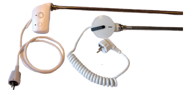
Quick connection to electronic control box