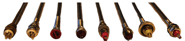
Examples of connections