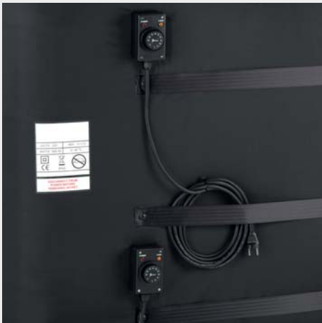
Bespoke printing for the HIBC/B is available, detailing your company information and specifications for the element.