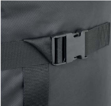
Quick release buckles are used for fixing the jacket quickly and easily.