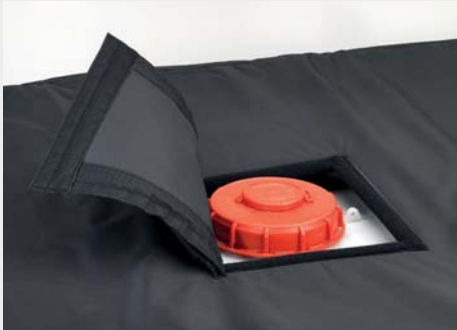
Flap for filler access.