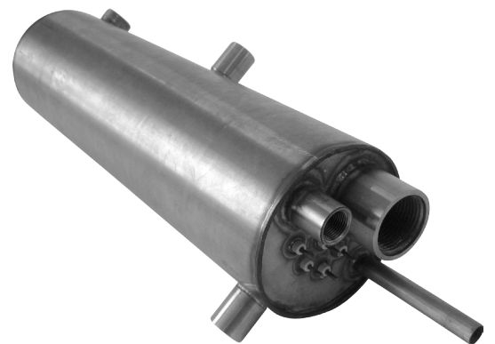
Example of product design