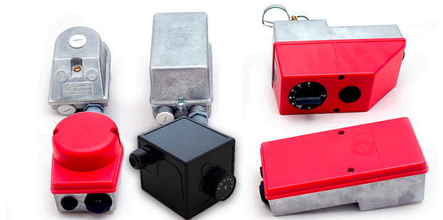
Example of product design